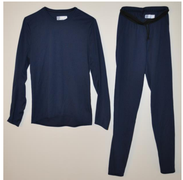
Figure 1. Photograph of the test apparel.

ParvoMedics TrueMax 2400 Metabolic Cart (ParvoMedics, Salt Lake City, USA), and blood samples were drawn from a fingertip every two minutes to measure blood lactate concentration with a Lactate Pro analyzer (Arkray Inc., Kyoto, Japan). Each subject completed four test sessions (two per apparel test condition), with each session being at least 48 hours apart. The subjects were instructed to refrain from any behavior outside of their normal physical activity, diet, and sleeping patterns during their entire testing period.